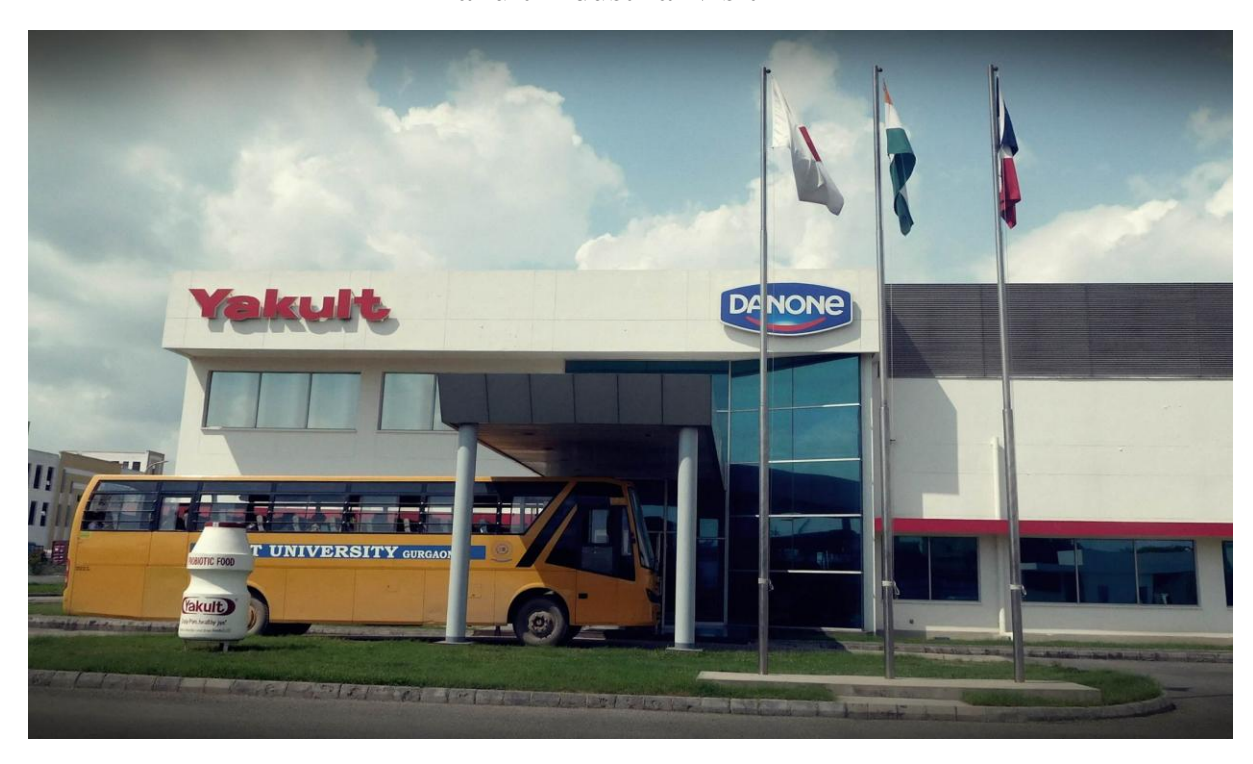
Yakult Industrial Visit