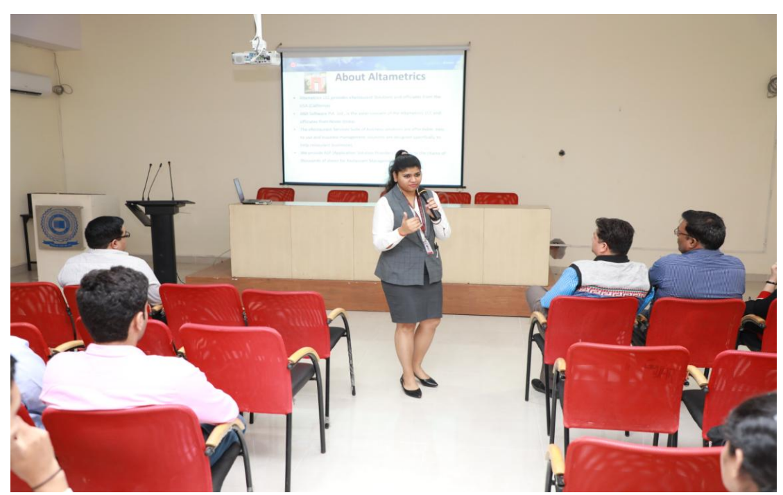
ANR Software Campus Placement