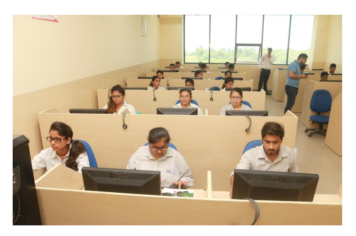
Coding Test Practice