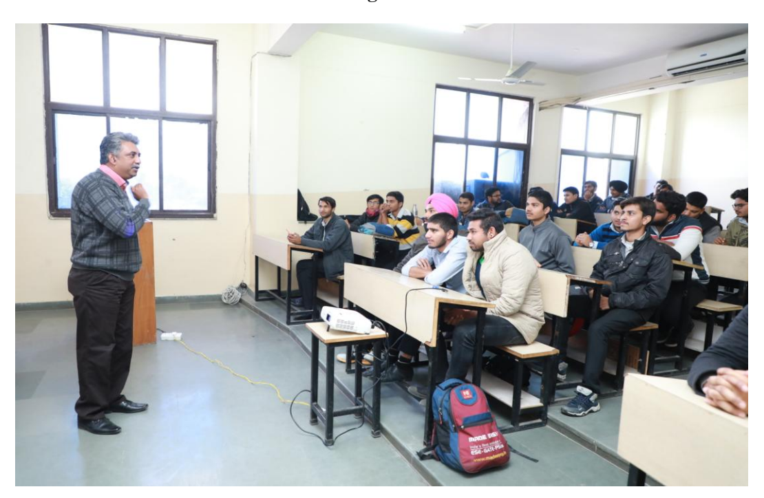
Smart Brains Session for Placement