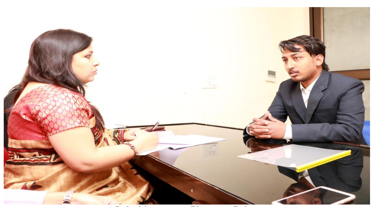
Indovision campus Placement Drive