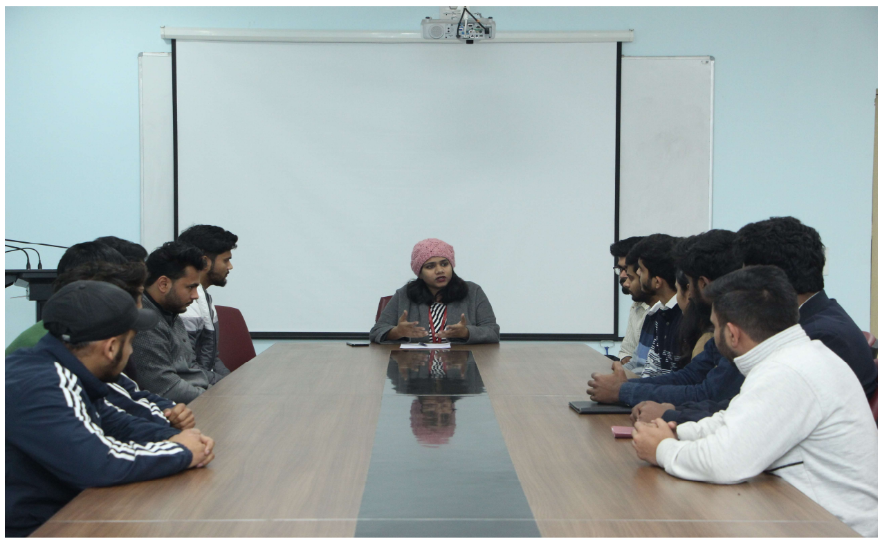
Group Discussion Round -Tech Mahindra