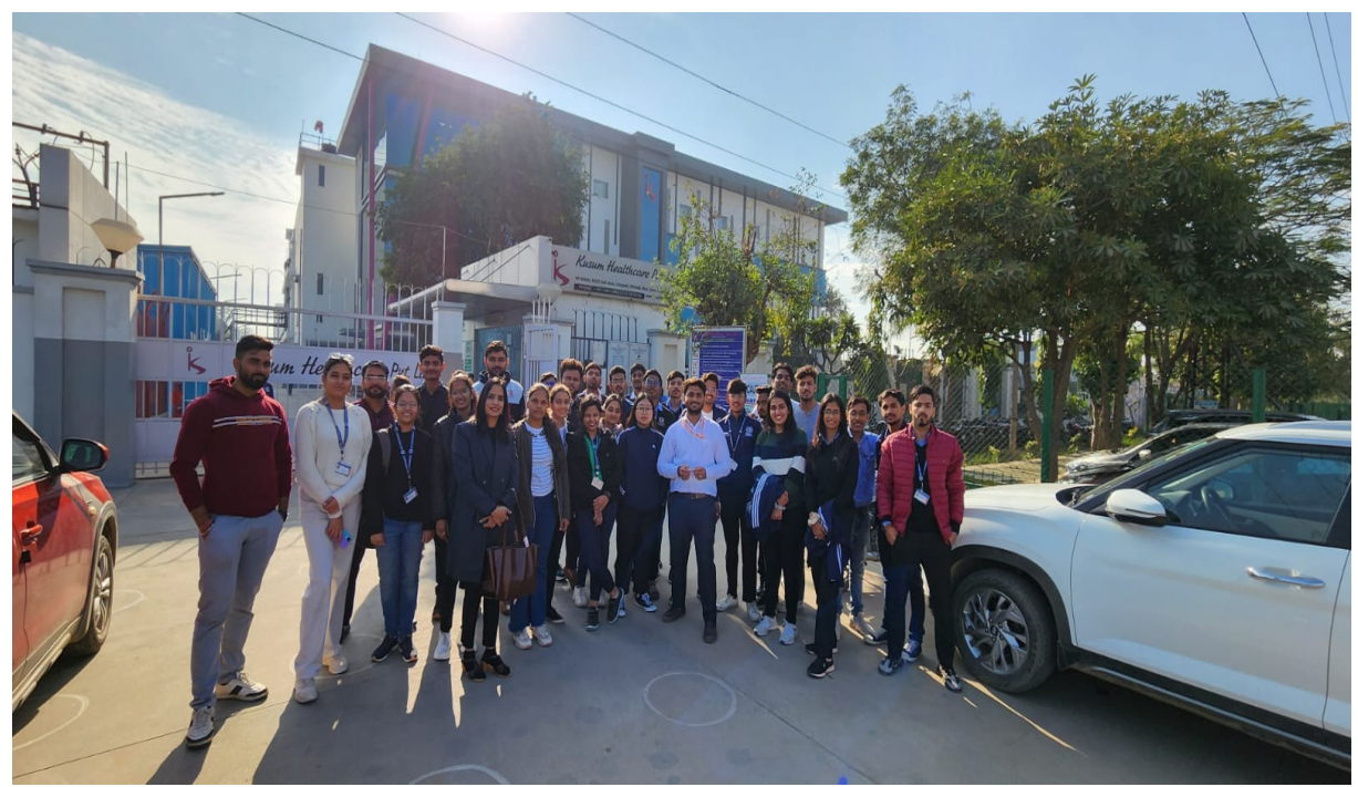
Kusum Healthcare Industrial Visit