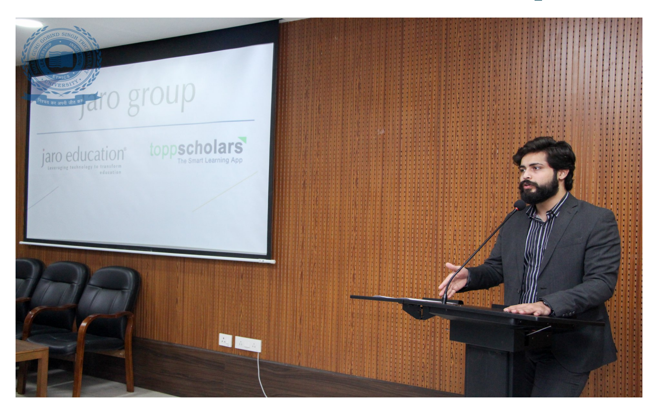
jaro Education Campus Placement Drive