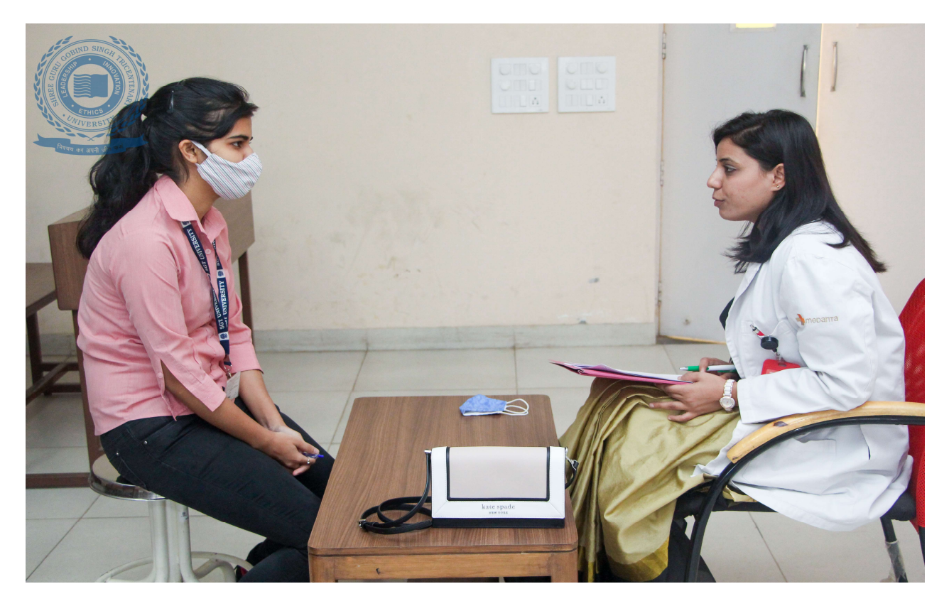
Medanta Hospital Campus Placement Drive