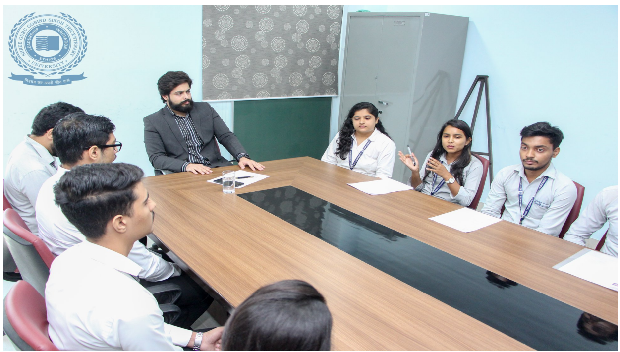
Group Discussion Round-jaro Education