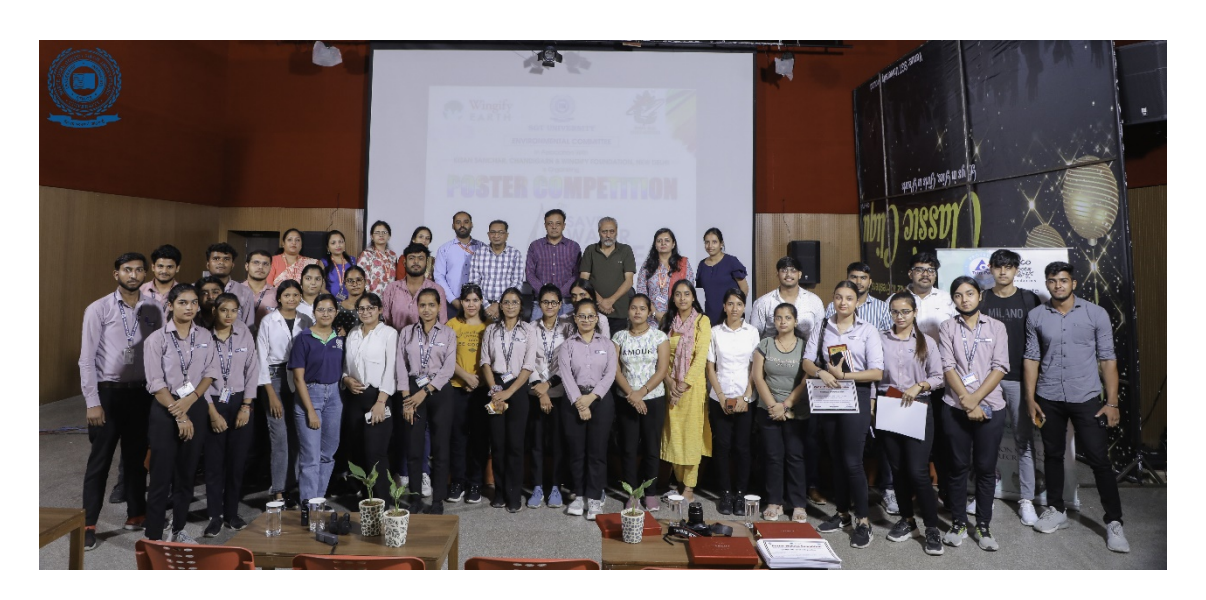
GROUP PHOTOS WITH THE PARTICIPANTS

Budhera, Gurugram-Badli Road, Gurugram (Haryana) – 122505 Ph.: 0124-2278183, 2278184, 2278185 PRIZE DISTRIBUTION CREMONY FOR THE WINNERS