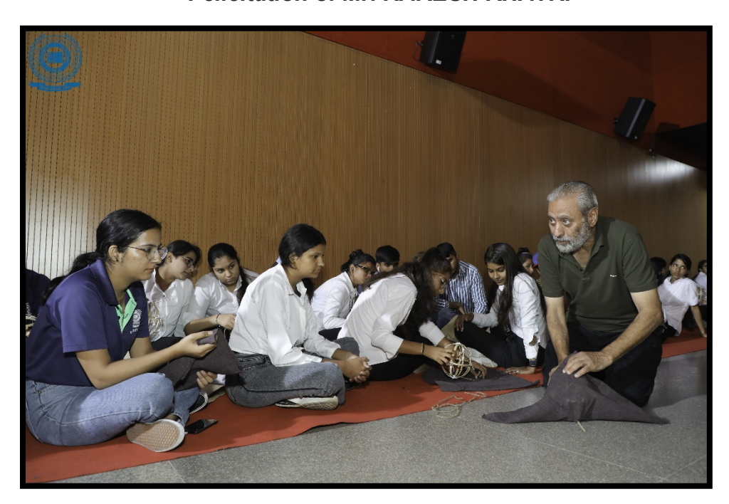
NEST MAKING ACTIVITY