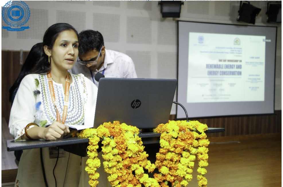
Figure 1 Welcome note

SHREE GURU GOBIND SINGH TRICENTENARY UNIVERSITY (UGC Approved) Gurugram, Delhi-NCR