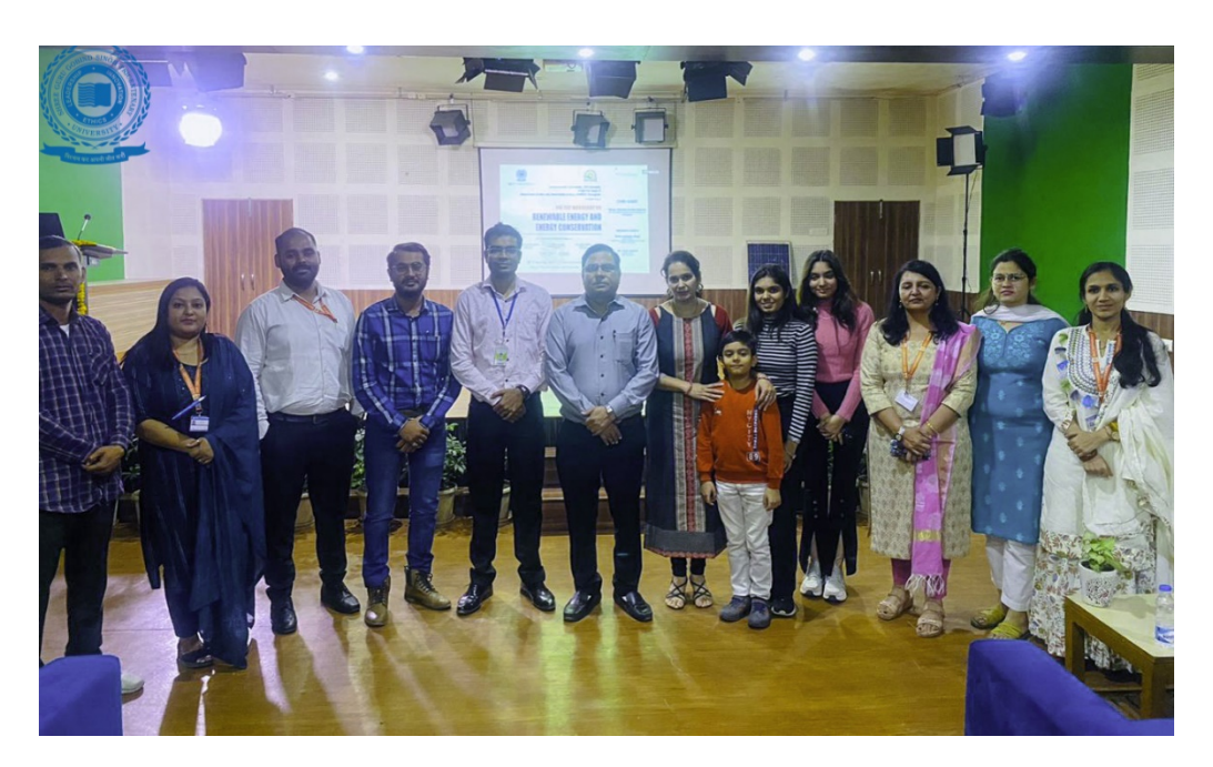
Figure 8 Group picture

Budhera, Gurugram-Badli Road, Gurugram (Haryana) – 122505 Ph.: 0124-2278183, 2278184, 2278185