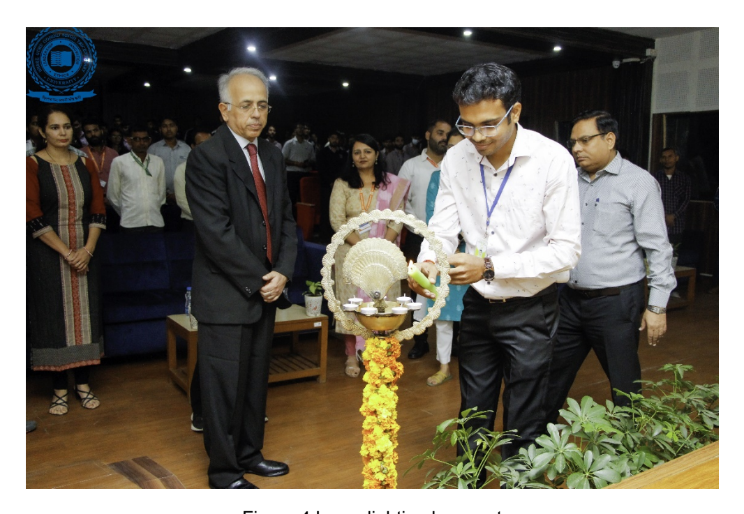
Figure 4 Lamp lighting by guest