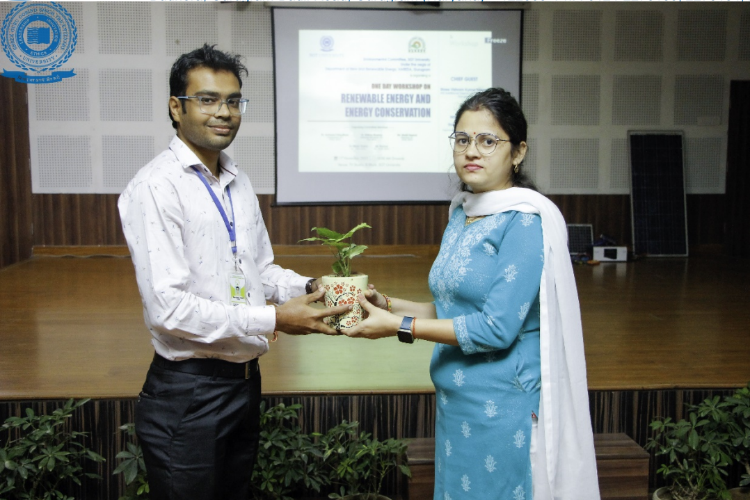
Figure 3 welcome of the Guest with sapling