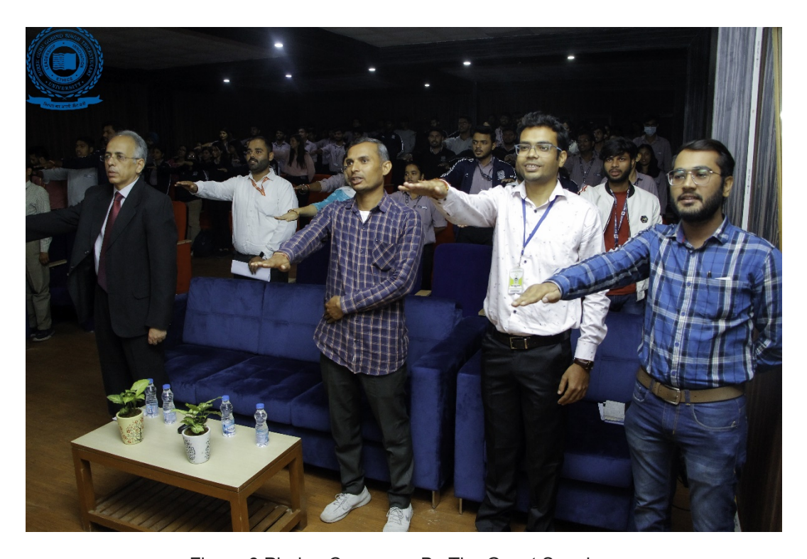
Figure 6 Pledge Ceremony By The Guest Speaker