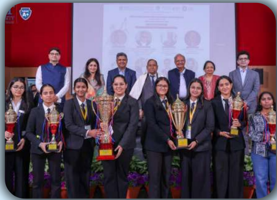
Valedictory Ceremony and Winners Announcement of 3rd SGTU Ranka International Trial Advocacy Competition, 2026