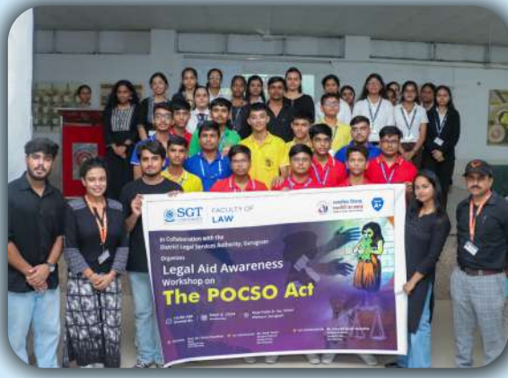
Legal Aid Awareness Workshop "The POCSO Act" 2024