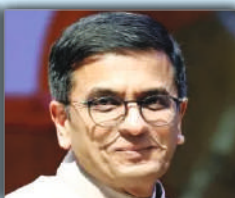
Justice D.Y. Chandrachud Former Chief Justice, Supreme Court of India