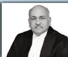
Justice Pankaj Mittal Judge, Supreme Court of India