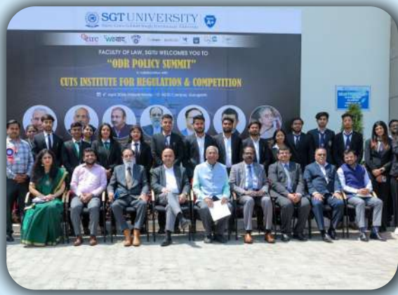
ODR Policy Summit 2024