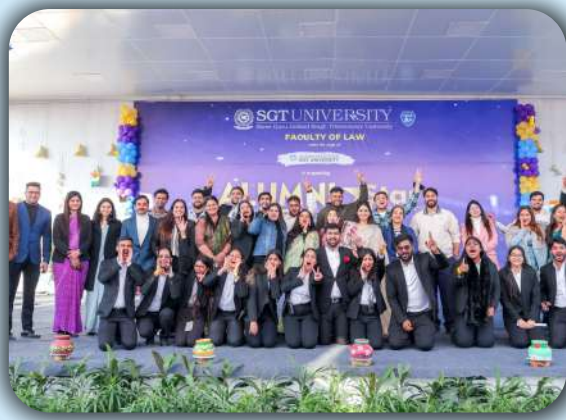
Alumni Meet 2024