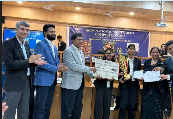
Runners-up DGIM National Moot Court Competition 2025