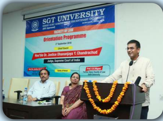
Hon'ble (Dr.) Justice D.Y.Chandrachud (Former Chief Justice of India) graced the orientation Programme 2016