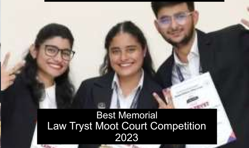
Best Memorial Law Tryst Moot Court Competition 2023