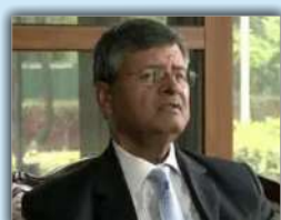
Justice Ajay Rastogi Former Judge, Supreme Court of India