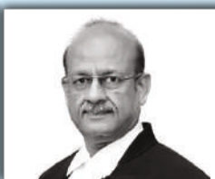
Justice Rajesh Bindal Former Judge, Supreme Court of India