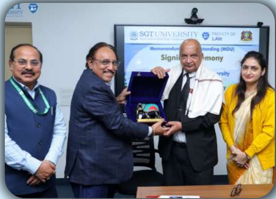
The Signing of Memorandum of Understanding ( MoU ) between the India International University of Legal Education and Research (IIULER), Goa and SGT University, 2025