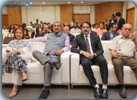
Valedictory Ceremony of Dr. Lalit Bhasin 1st International Mediation Competition, 2026