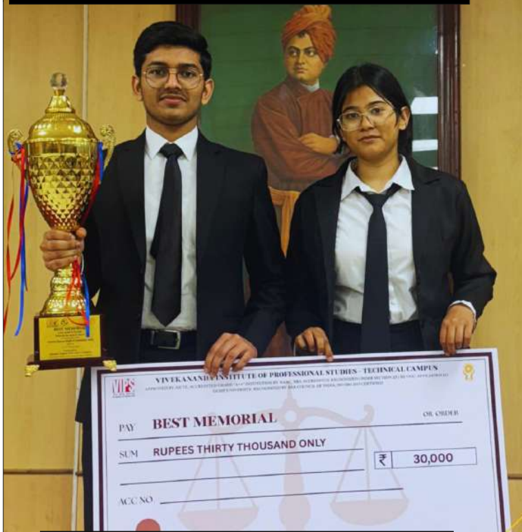
Best Memorial Lex Judicium 2026 National Moot Court Competition 2026