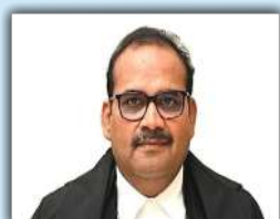
Justice J.K. Maheshwari Judge Supreme Court of India