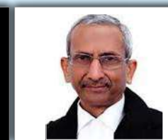
Justice Adarsh Kumar Goel Former Judge, Supreme Court of India