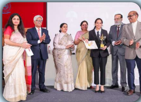
1st SGTU INTERNATIONAL MOOT COURT COMPETITION, 2024