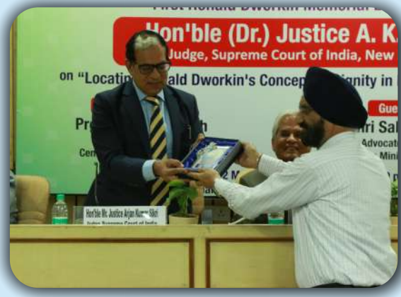
Hon'ble (Dr.) Justice A.K. Sikri graced the event of First Ronald Dworkin Memorial Lecture