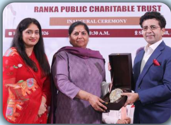
Hon'ble Justice Neena Bansal Krishna , Judge Delhi High Court, at the Inaugural Ceremony of 3 rd SGTU Ranka International Trial Advocacy 2026