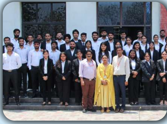
Vidhigya - Placement & Internship Drive 2024