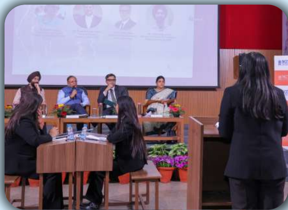
Final Rounds of 3 rd SGTU Ranka International Trial Advocacy Competition, 2026