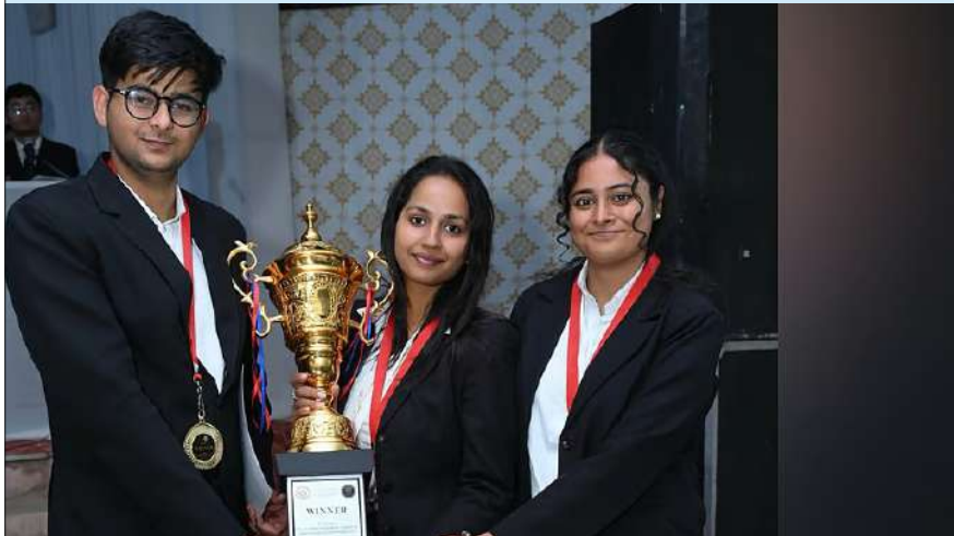
Winners B.L. Purohit Memorial National Moot Court Competition 2025