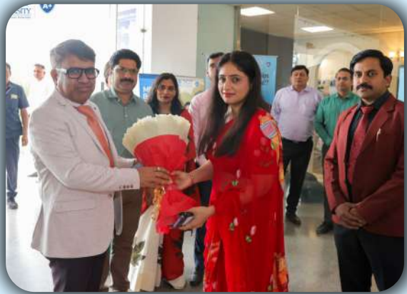
Inaugural Ceremony of 3rd SGTU Ranka International Trial Advocacy Competition, 2026