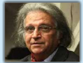
Prof. (Dr.) Upendra Baxi Emeritus Professor of Law, Universities of Warwick and Delhi