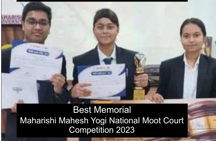
Best Memorial Maharishi Mahesh Yogi National Moot Court Competition 2023