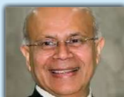
Justice Navin Sinha Former Judge, Supreme Court of India