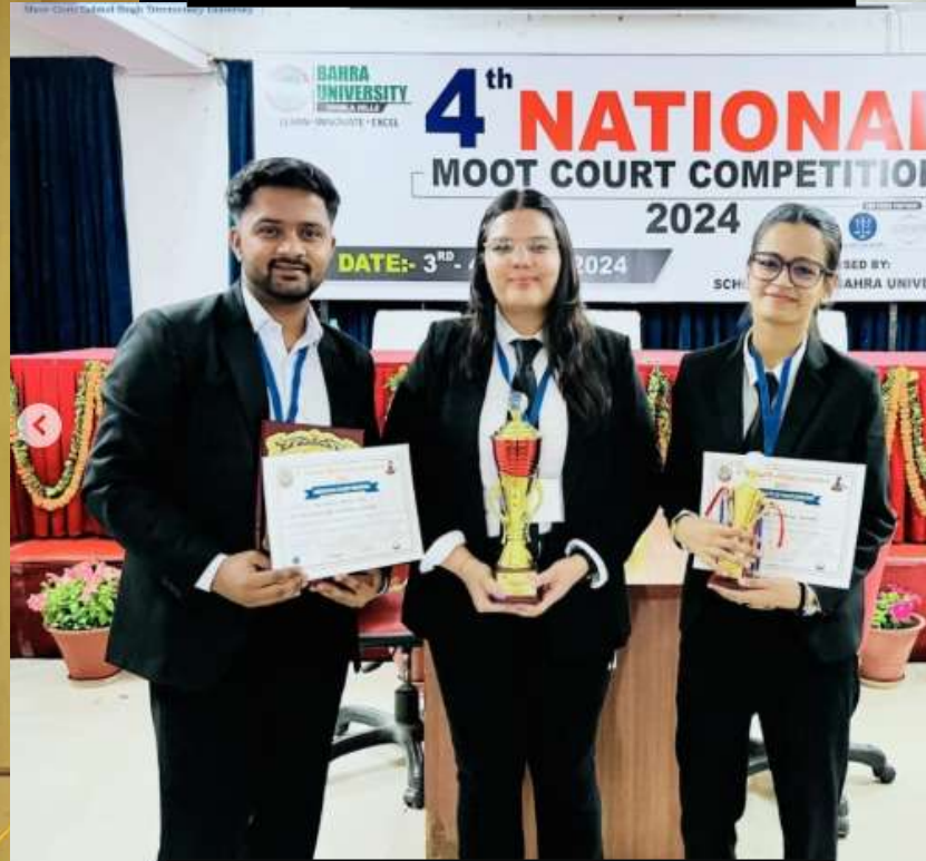
Runners-up & Best Memorial 4th Bahra University National Moot Court Competition 2024