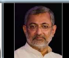
Justice Kurian Joseph Former Judge, Supreme Court of India