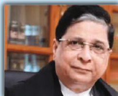
Justice Deepak Misra Former Chief Justice, Supreme Court of India