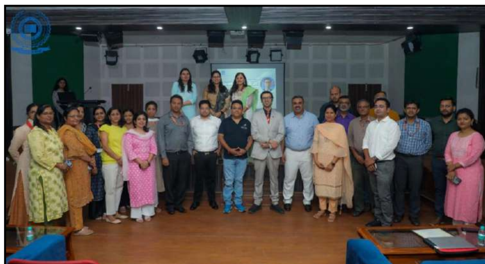
Lecture on “Biostatistics” on 30th of January 2023