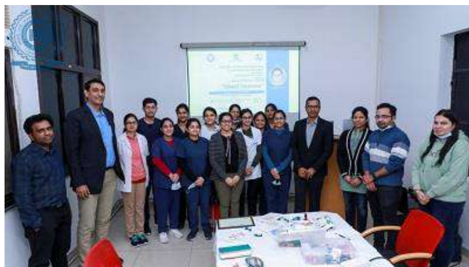
Lecture Cum Hands on Workshop on “Rotary Endodontics” on 25th Jan 2022