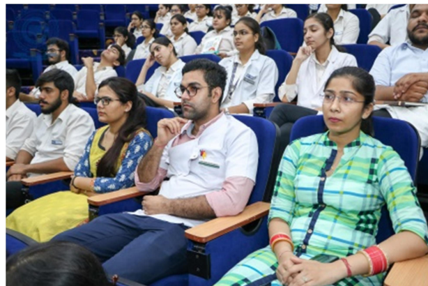
Students Attending Session