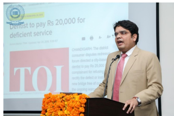
Inauguration & Felicitation of the Speaker