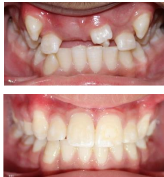
Impacted teeth case