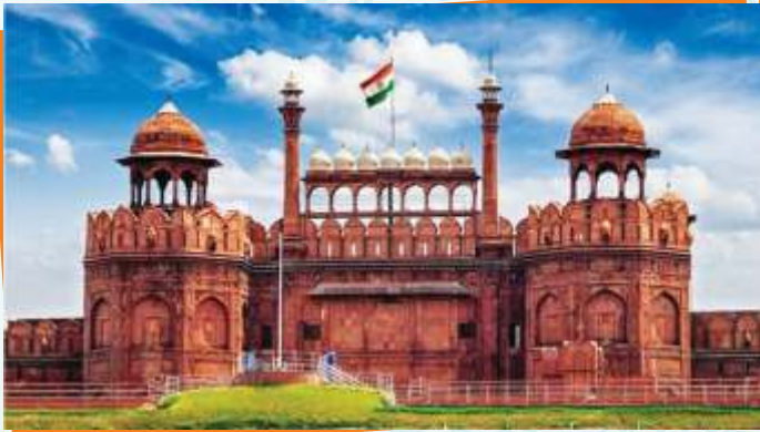
Red Fort, Delhi