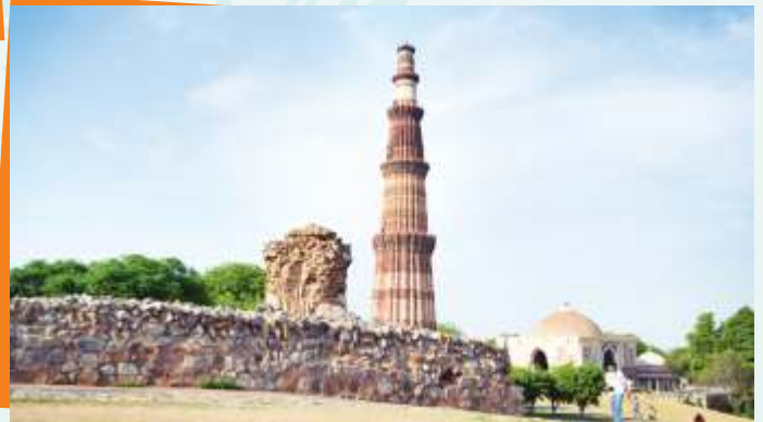
Qutub Minar, Delhi