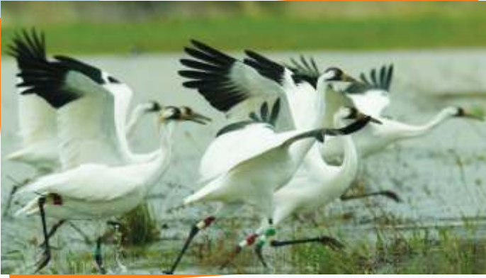
Sultanpur Bird Life Sanctuary: Sultanpur National Park